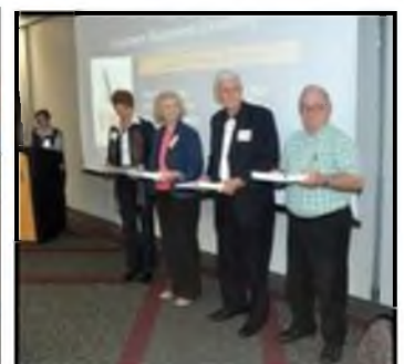
Receiving new members