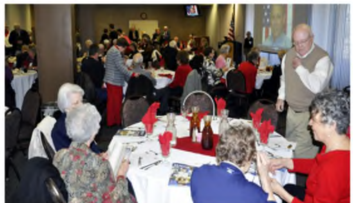
February Luncheon meeting