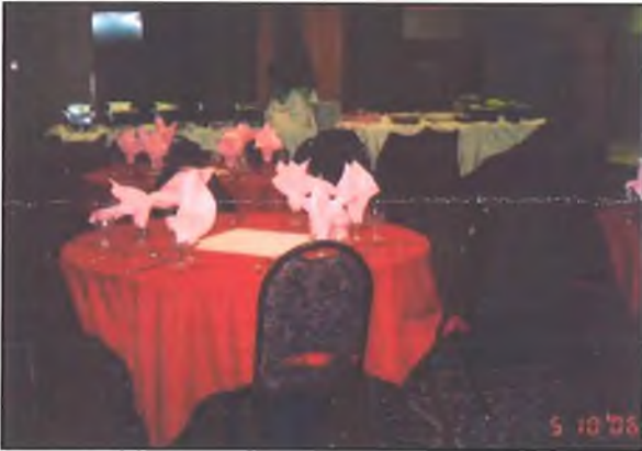
Above: Colorful Decorations for the May luncheon.

Pictures shown here were taken at the May, 2006 Academy Luncheon