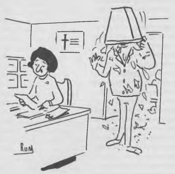
"What did the executive committee think of your suggestion to revise the remodeling program?"