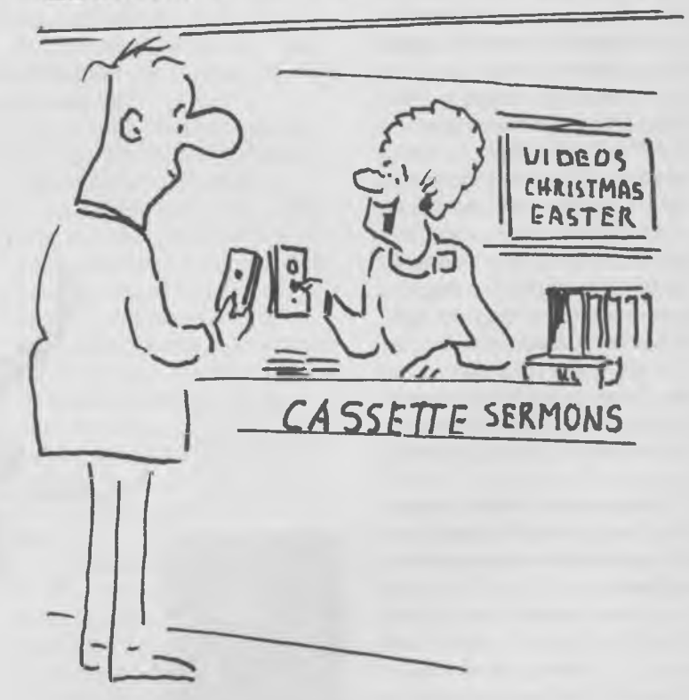
When you lose your voice, Reverend Perry—you can just fake your sermon.