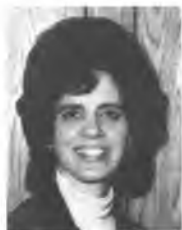
by Ruth Ann Polston

When you shake off mediocrity, some will set up a clamor that may shock the stirring giant within you back to inactivity: You can't do that. . . . You weren't raised that way. . . .