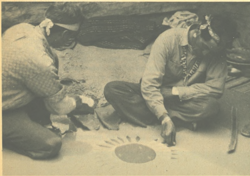
TWO assistants of medicine men filling in the details of sand paintings which are supposed to benefit an ailing person.