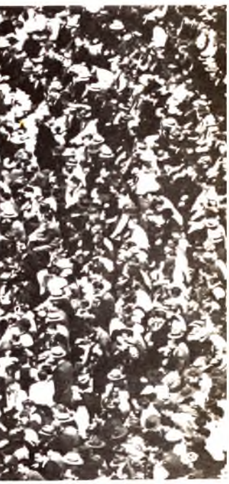
Multitudes to Move Us See Page 8