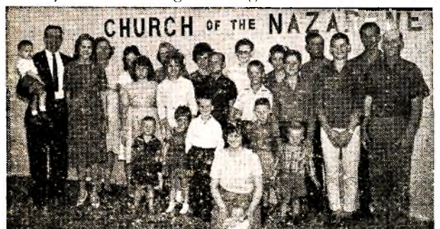
Colorado City congregation, 1963

Prayer and fasting meetings for adults and for