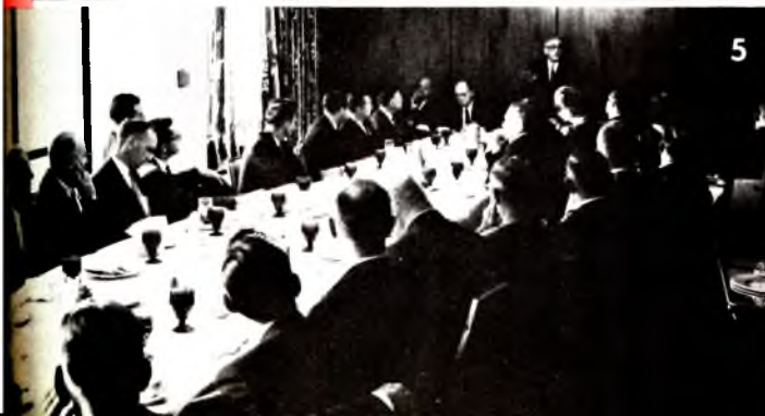
Nazarene ministers in the United States chaplaincy.