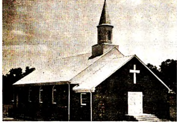
Bell Road Church of the Nazarene, Nashville, Tennessee

ACHIEVEMENT was the watchword for the Bell Road Church last year. The Sunday school enrollment climbed from 86 to 164. The Sunday school average attendance rose from 68 to 100. The overall giving increased from $6,379 to $9,670. Born in a tent, the church property is now valued at $65,000.