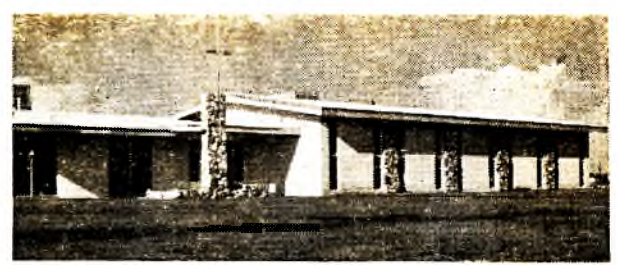
Deer Valley Church, Phoenix, Arizona

For fifteen months, services were held in these two homes while a suitable location was sought for. Miracles were wrought; reams of red tape were processed, and finally a three-and-one-half-acre site,