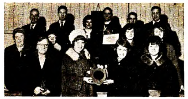
New Nazarenes received on profession of faith, Derbyshire Street Church of the Nazarene, Leeds, England.

converts and members of the church. These organizations have served as door-openers and interest-catchers for newcomers, in addition to giving spiritual strength to growing Christians.