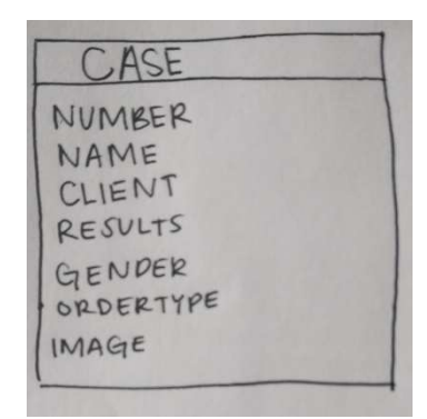
Figure 2 – Final ERD

The ERD came out looking about how figure 2 looks, with a few tweaks.