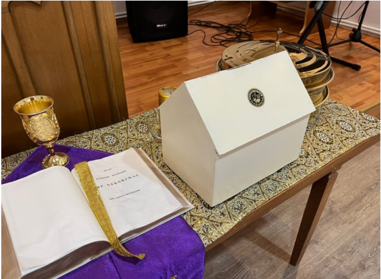
Alabaster Offering Box

The church also collects three major offerings throughout the year. In March and August, the offering is for the World Evangelism Fund. In October, the offering is intended to support education provided by European Nazarene College in Armenia.