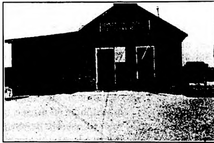
DEMING CHURCH AND SEVEN-ROOM PARSONAGE

Peculiar, yet strange from its birth, this work was fed by the ravens, both before and after her adoption, and is yet alive and hearty. Its peculiarities, according to St. Paul's Gospel, babes are carnal but this one never lost its infantile justification, for she was obedient to the light.