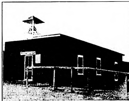
HURLEY CHURCH AND THREE-ROOM PARSONAGE