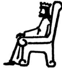
Jesus on throne