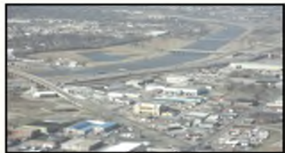
West view from Devon Tower

We had a wonderful outing to the Devon Tower. I am so sorry we couldn't get some of you on this trip; we did have a full house. We won't be able to get