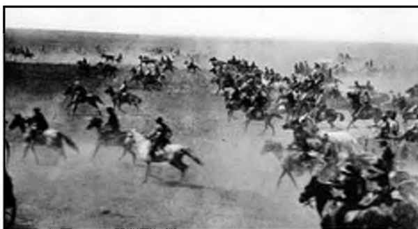
OKLAHOMA LAND RUN APRIL 22, 1889