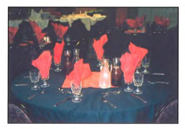
Above: Colorful setting for the Academy of Senior Professionals luncheon meeting