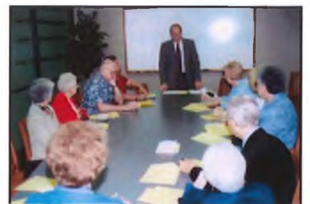
Research Interest Group: Discussion topic was "Identity Fraud"