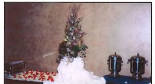
Decorations for the May ASP luncheon.