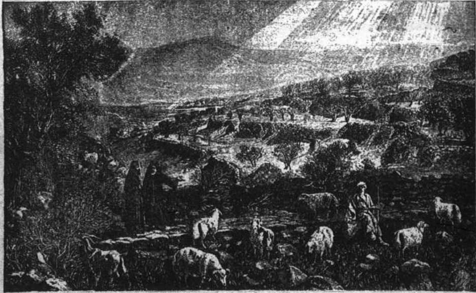
THE SHEPHERD'S FIELD.

ed for home. He was going to put it in a good business in his native state, marry the girl he loved, and settle down in a little home of his own. He stopped overnight in a large city and after supper went out walking with a pleasant stranger he had met. The man asked him to go into a gambling room and the young man consented. He is not clear